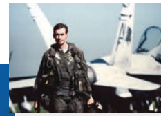
CALM UNDER PRESSURE