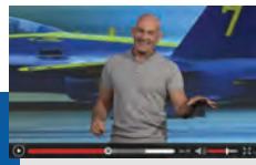
VIRTUAL EVENT HIGHLIGHTS