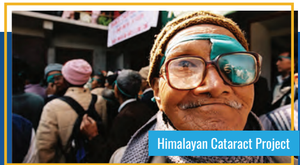
Himalayan Cataract Project

Restoring hope and dignity to recently homeless families.