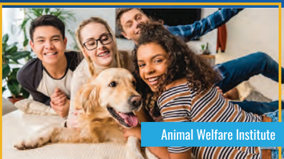
Animal Welfare Institute

Promoting legislation to protect animals.