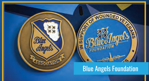
Blue Angels Foundation

Promoting legislation to protect animals.