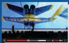
HOW GOOD DO YOU WANT IT TO BE?