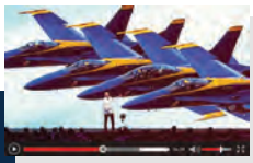
THE KEYNOTE EXPERIENCE