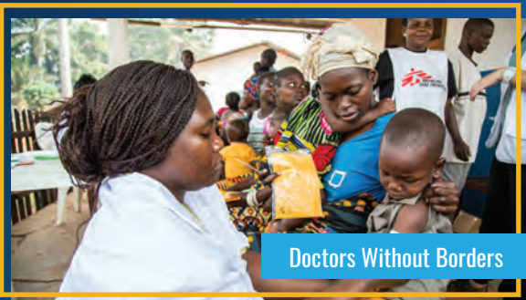
Doctors Without Borders

Working to eliminate preventable and curable blindness in under-resourced communities.