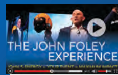
THE JOHN FOLEY EXPERIENCE