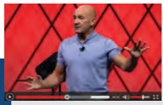
CONNECT. ALIGN. COMMIT